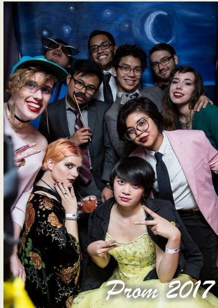
Prom Fundraiser at Martini Room