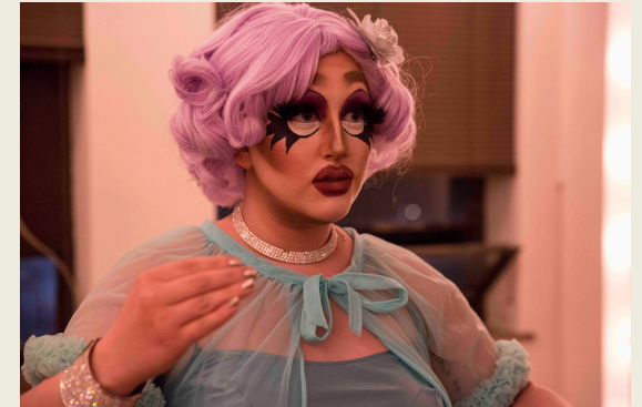
Chicago Burlesque Showcase